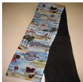
HAWAIIAN PRINT MV SCARF'S $3