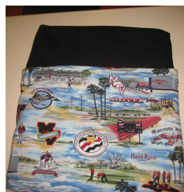
HAWAIIAN PRINT MV BLANKETS $5