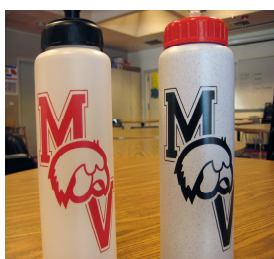
MV PLASTIC SPORT BOTTLE FRONT $1.00