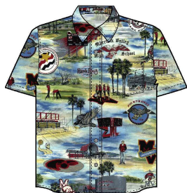
MV HAWAIIAN SHIRT $8.00