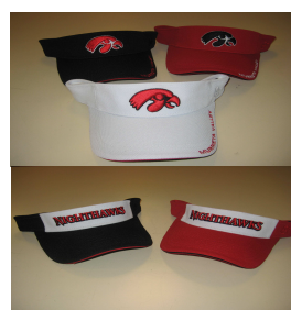
HAWK HEAD VISOR $6.00