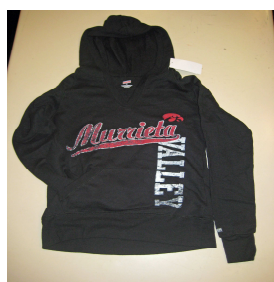
PULL OVER MV HOODIE $5 (ONLY SMALLS LEFT)