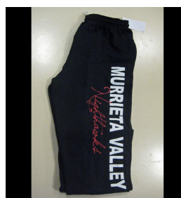
MEN'S MV SWEAT PANTS $7.50