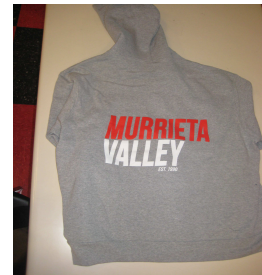
ZIPPERED HOODIE SWEATSHIRT BACK VIEW