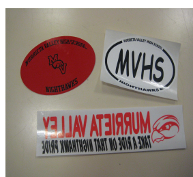
MVHS BUMPER STICKERS $1.00