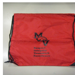
NIGHTHAWK BAGS $5.00