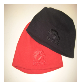
NIGHTHAWK BEANIES $6.00