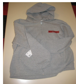
ZIPPERED HOODIE SWEATSHIRT AND $15