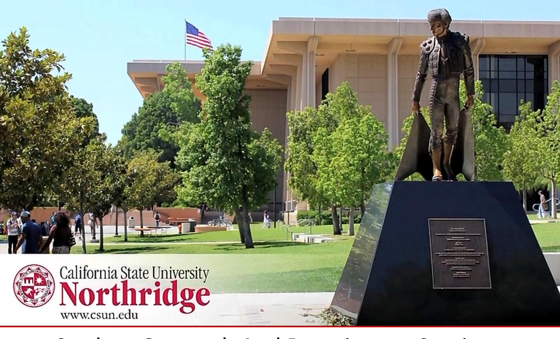
Student Outreach And Recruitment Services www.csun.edu/outreach