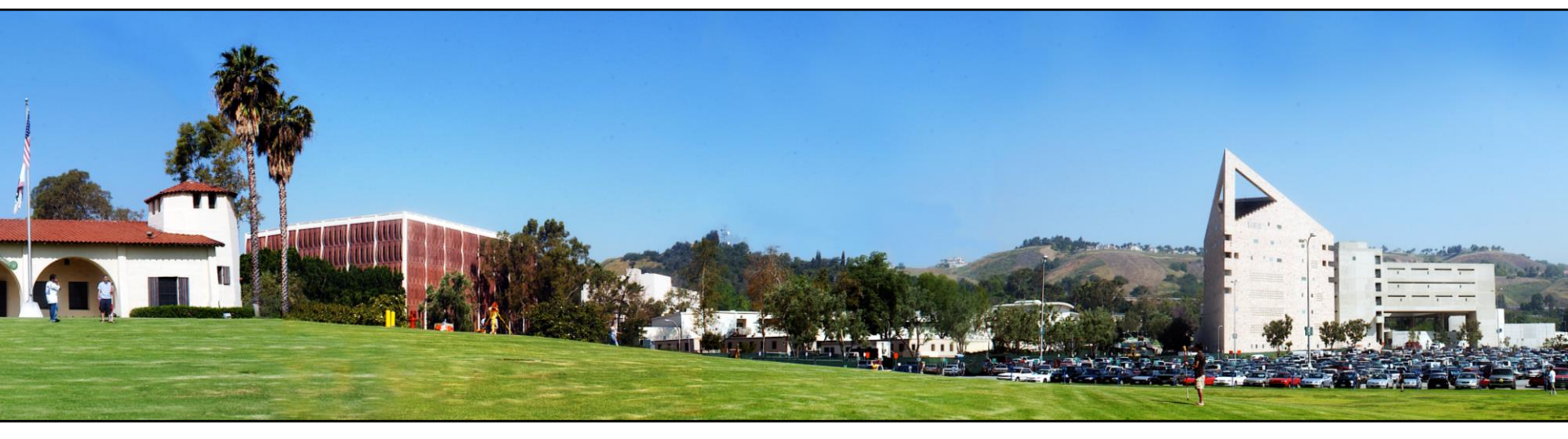
"Campus Highlights & Admission Specific Practices"