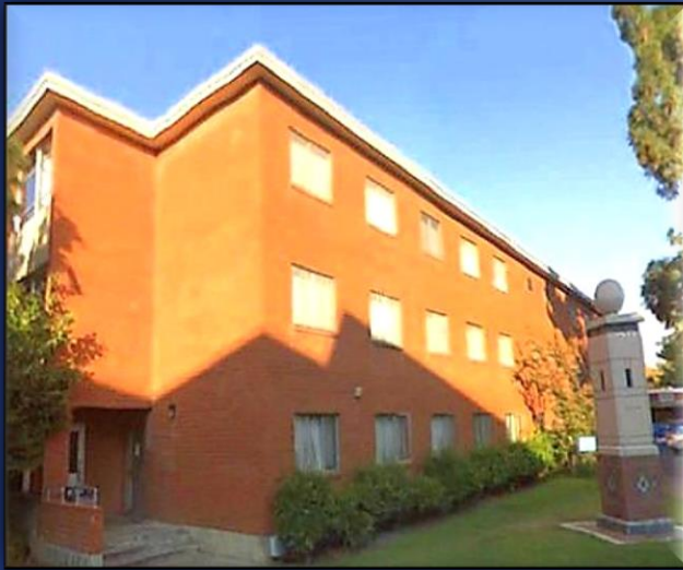
International House (one block from campus)