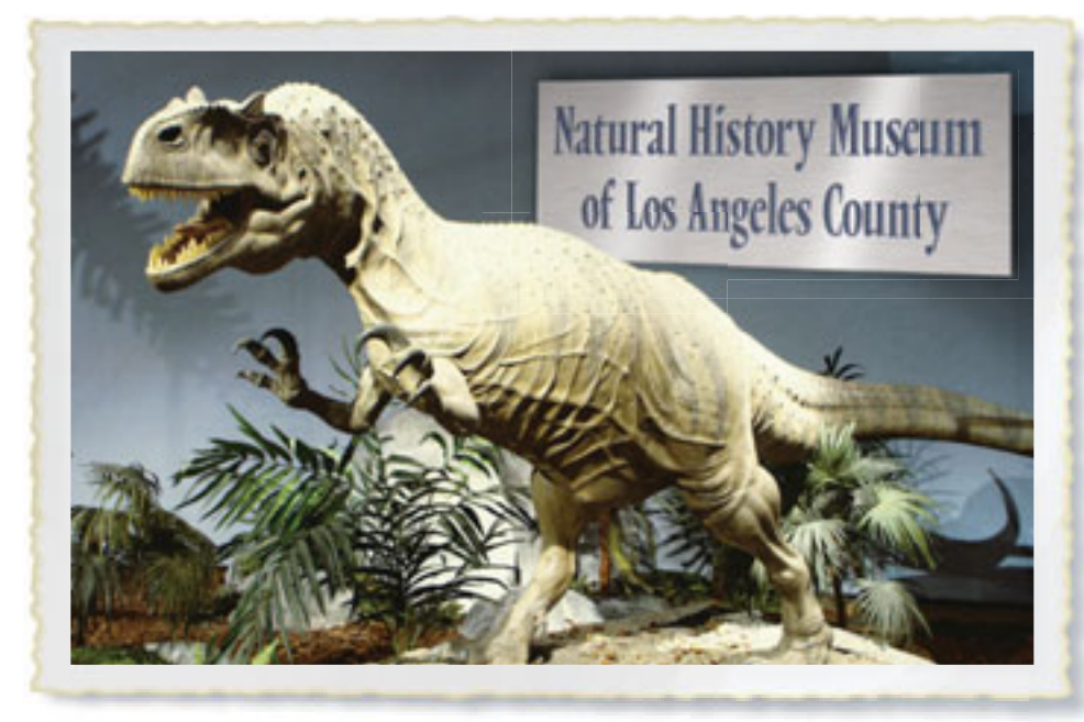
The Natural History Museum of Los Angeles County has more than 33 million items in its collections!

Objective Use skills and strategies to solve word problems.