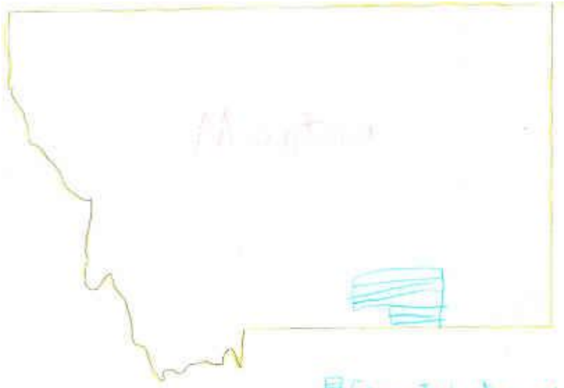
Crow Tribe Reservation

The Crow Indian tribal life differed from other tribes because the women often played very important roles within their community. When they got married, the males moved in with the woman and their families. Females within the Crow tribe could even be chief.