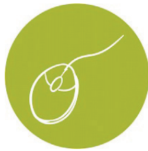
Information and Communication Technology