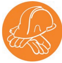
Building and Construction Trades