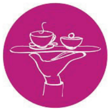
Hospitality, Tourism and Recreation