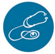
Health Science Medical Technology