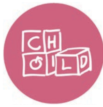
Education - Child Development Family Services