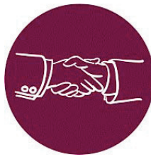
Marketing Sales and Service