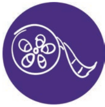
Arts, Media, and Entertainment

CTE is an educational model that combines high school and post-secondary academics with hands-on learning to prepare students for their career of choice and multiple options after high school, including university, trade school, the military, or the workforce. MVUSD CTE pathways consist of a three-course sequence which culminates in a robust capstone course. Currently, MVUSD offers pathways in the following industry sectors: