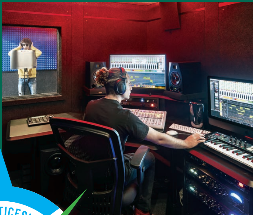
Chart Your Own Path