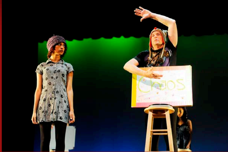
Theater & Dance