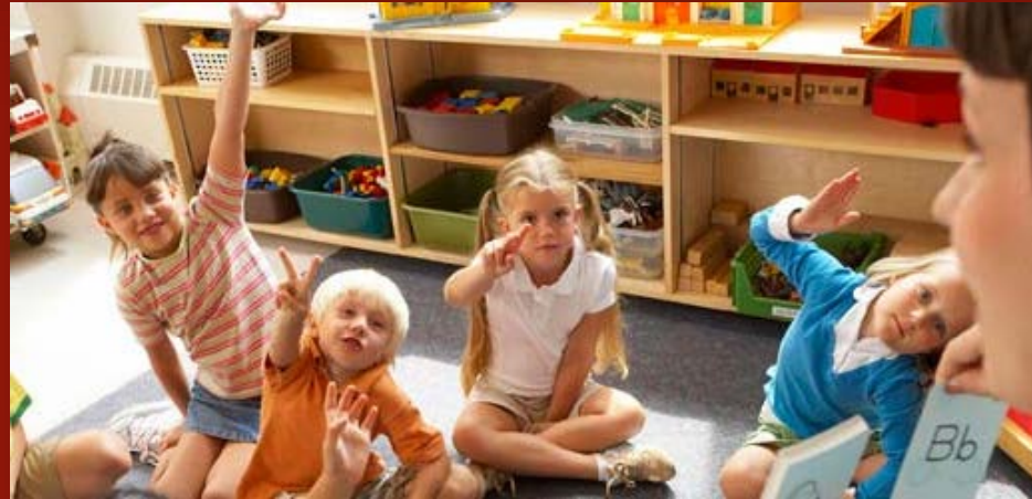
Teacher Education and Childhood Development Studies