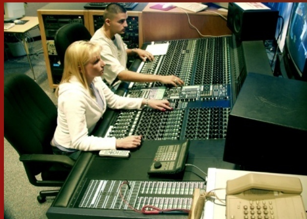
Audio & Video Technology