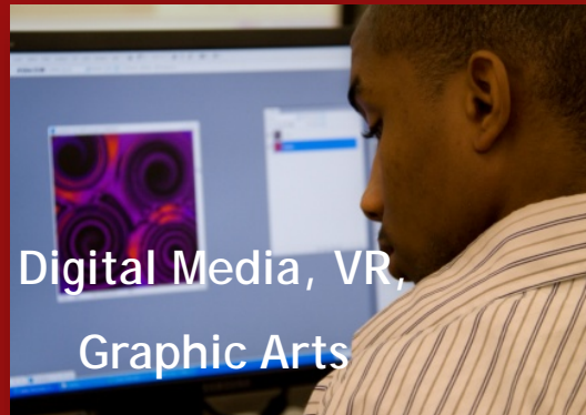
Digital Media, VR, Graphic Arts