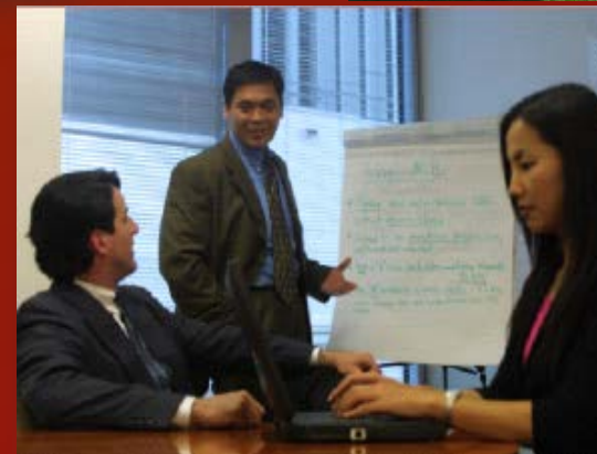
Business and a 2+2 Business Pathway