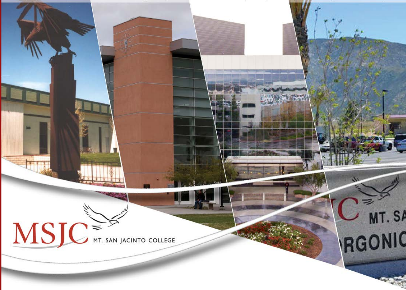
San Geronio Pass Campus