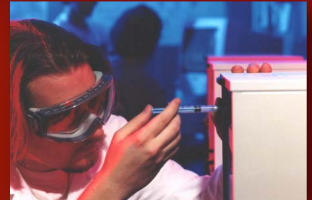
Computer Information Systems