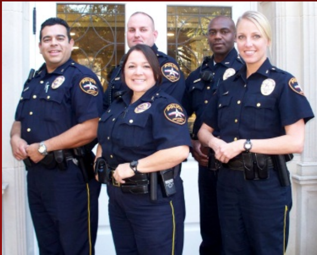
Administration of Justice